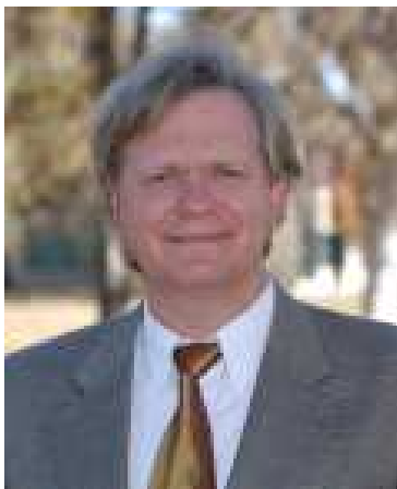
Dr. Brian Schmidt, 2011 Nobel Laureate